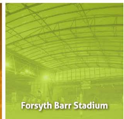
Forsyth Barr Stadium